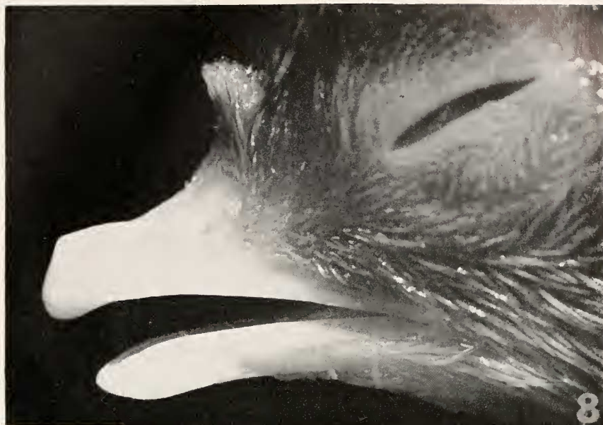
FIGURE 8. Snood at 19th day of incubation.